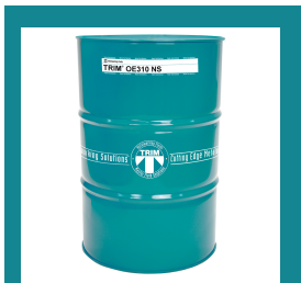
54-gallon drum SKU: OE310NS/54 UPC-12: 641238076728