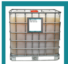
270-gallon tote SKU: OE310NS/NR270P UPC-12: 641238077510