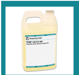
1-gallon jug SKU: OE310NS/1 UPC-12: 641238077497