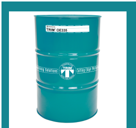
54-gallon drum SKU: OE335/54 UPC-12: 641238076629