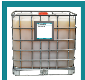
270-gallon tote SKU: OE335/NR270P UPC-12: 641238077701