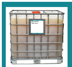
270-gallon tote SKU: OG108/NR270P UPC-12: 641238077732

TRIM® OG108 | ©2009-2019 Master Fluid Solutions® | 2019-01-17