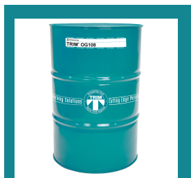
54-gallon drum SKU: OG108/54 UPC-12: 641238076568