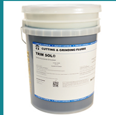
5-gallon pail SKU: SOL-5G UPC-12: 641238008392