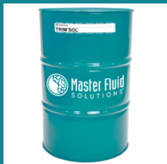
54-gallon drum SKU: SOL-54G UPC-12: 641238008408