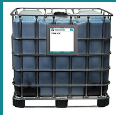
270-gallon tote SKU: SOL-270G UPC-12: 641238034216