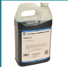
1-gallon jug SKU: SOL-1G UPC-12: 641238008361