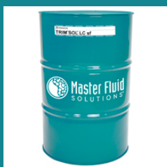
54-gallon drum SKU: SOLLCSF-54G UPC-12: 641238008675