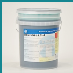
5-gallon pail SKU: SOLLCSF-5G UPC-12: 641238008668