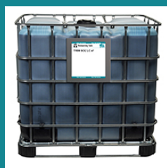
270-gallon tote SKU: SOLLCSF-270G UPC-12: 641238036234