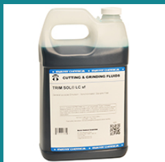
1-gallon jug SKU: SOLLCSF-1G UPC-12: 641238008651