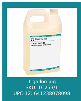
1-gallon jug SKU: TC253/1 UPC-12: 641238078098