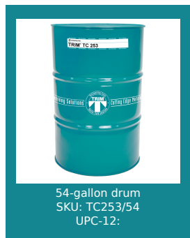
54-gallon drum SKU: TC253/54 UPC-12:

TRIM® TC 253 | ©2018-2019 Master Fluid Solutions® | 2019-01-21