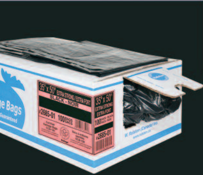
Industrial Garbage Bags