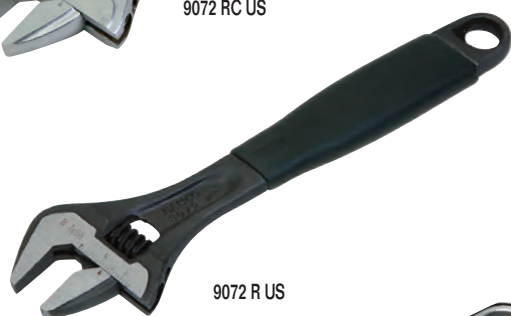
9072 R US