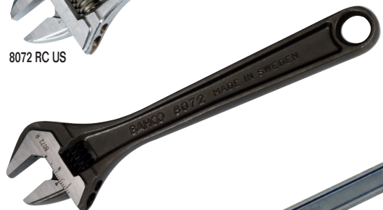
8072 R US