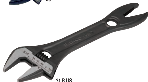
31 R US