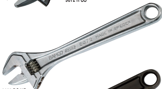
8072 RC US