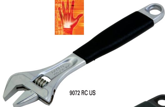
9072 RC US