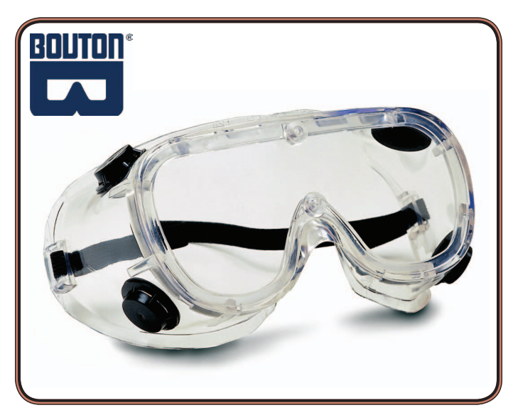
Polycarbonate lenses block 99.9% of the sun's ultraviolet rays. This ultraviolet protection has already been incorporated within the lens material when the lenses are being produced.