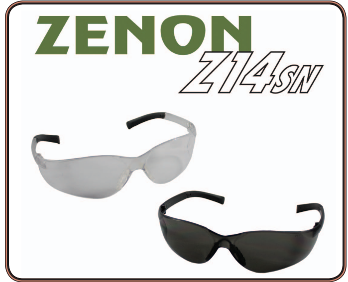
Polycarbonate lenses block 99.9% of the sun's ultraviolet rays. This ultraviolet protection has already been incorporated within the lens material when the lenses are being produced.

Country of Origin/Harmonization Code: Taiwan/9004.90.0000