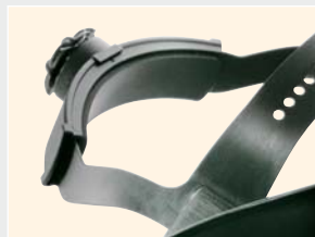
Easy-to-set, ratcheting headgear locking mechanism assures comfortable, secure fit.