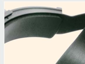
Comfortable cell foam on back of headgear.