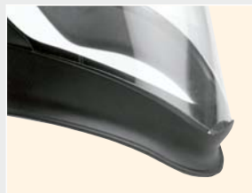
Shell offers built-in chin protection and extended top-of-head coverage.