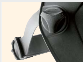
Highly adjustable headgear tilts visor nearer or farther from face depending on preference and application.