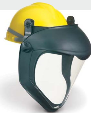
Hard Hat Adapter Accessory

*Face shield offers secondary protection and MUST be worn with spectacles or goggles.