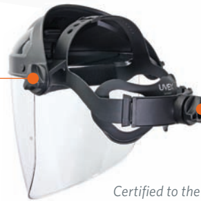
Certified to the requirements of ANSI Z87.1-2010 and CSA Z94.3 standards.