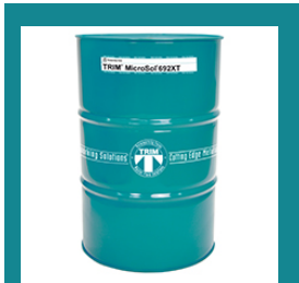
54-gallon drum SKU: MS692XT/54 UPC-12: 641238080114