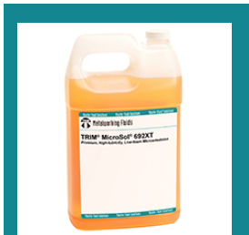
1-gallon jug SKU: MS692XT/1 UPC-12: 641238080138