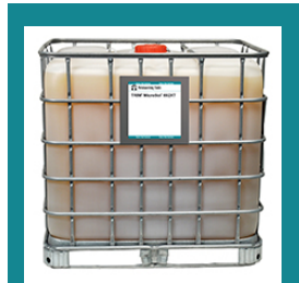
270-gallon tote SKU: MS692XT/NR270P UPC-12: 641238080145