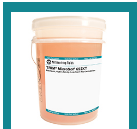
5-gallon pail SKU: MS692XT/5 UPC-12: 641238080121