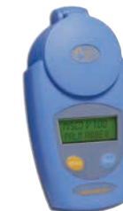
Palm Abbe® Digital Refractometer For fast, accurate, laboratory-precision readings in degrees Brix. Self-calibrating to water, ready to use in seconds. Easy-to-read display.