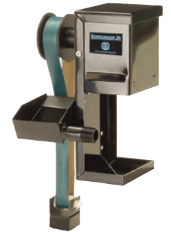
SCROUNGER® Jr. Oil Skimmer Effectively removes troublesome tramp oil from coolant for longer sump and tool life, better surface finish, and cleaner machines and workplace.