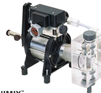
UNIMIX™ Water-driven, positive displacement proportioner dispenses coolant concentration on demand. Option for alkaline parts washing.