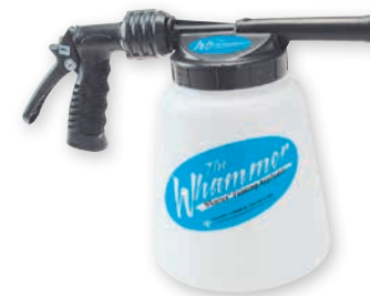
The Whammer™ Durable, low-cost dispenser for Master STAGES™ maintenance cleaners produces foaming stream for cleaning machine tools or large clean-in-place parts.