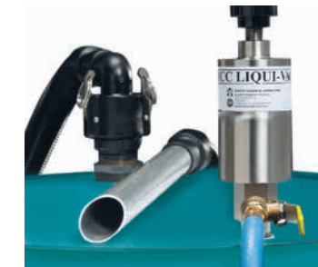
MCC Reversible LIQUI-VAC™ Sucks up tramp oils, used oils, and waste coolants— fast and simple. Can discharge fluids from drum to a separate container.