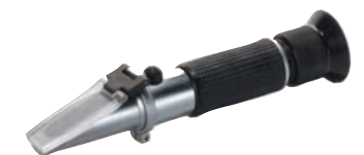
Refractometer Optical refractometer for quick fluid sample readings.