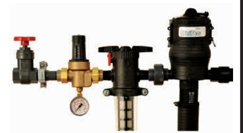
Mini Dos Compact, low- to mid-flow, fluid-driven proportional injector. Segregates harsh chemicals from critical internal components.