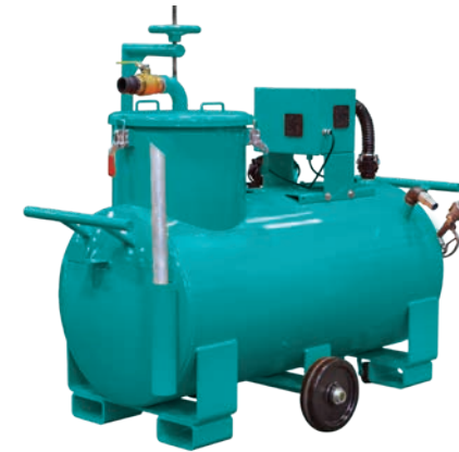
120V Electric Yellow Bellied Sump Sucker™ Cleans virtually any machine tool sump quickly by filtering sludge and chips from coolant. Available in multiple configurations, sizes, and power sources.

Customers who recycle their fluids realize a 40%–80% reduction in coolant and fluid purchases.