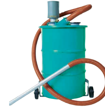
Drum Top Sump Cleaner™ Economical vacuum unit which converts an existing open-top drum into a powerful machine tool sump cleaner.