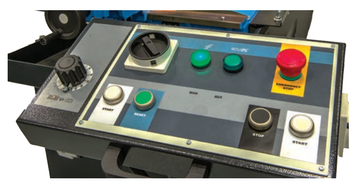
Sample control panel