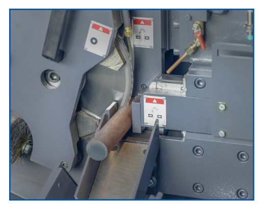
Sample of solid round being cut