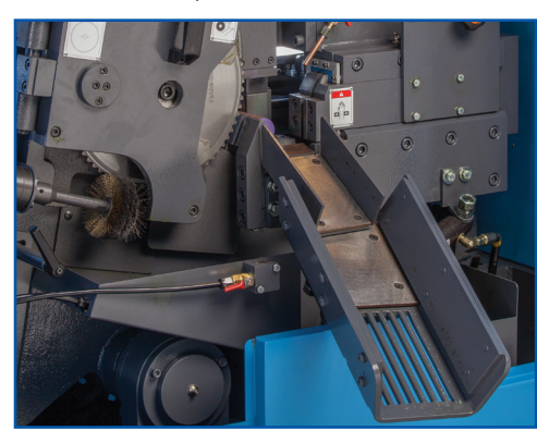
Close up of material chute