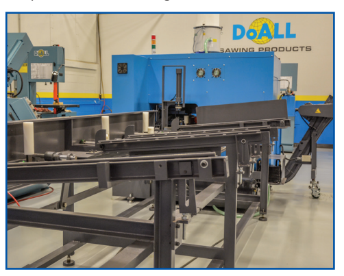
Bar loader table