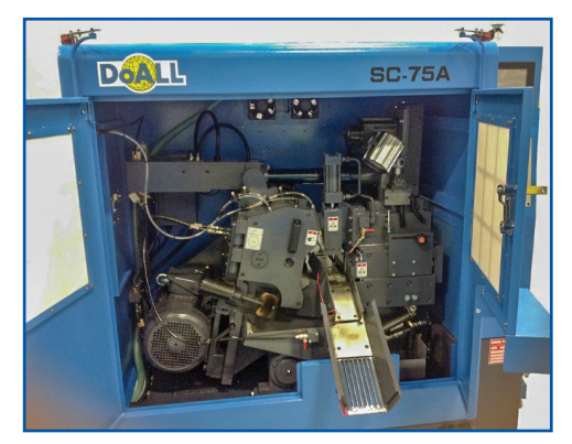
SC-75A Front with doors open