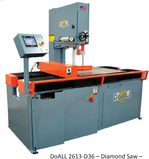
26 x 13" Capacity for Dry Friable Materials