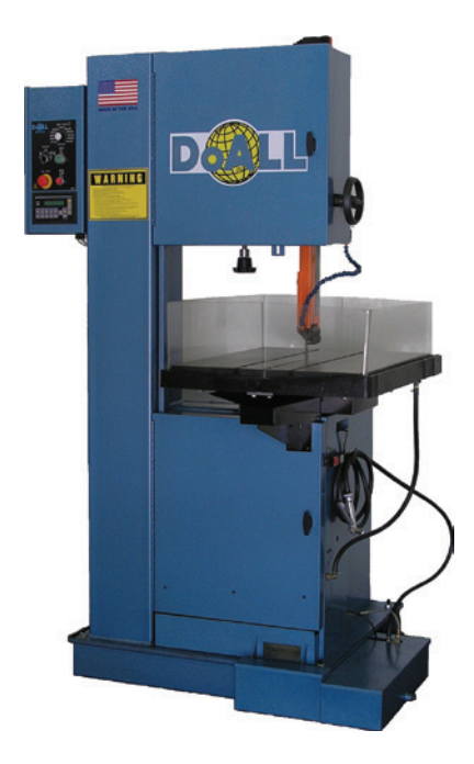
DoALL 2012-D12 Diamond Saw – 20 x 12" Capacity