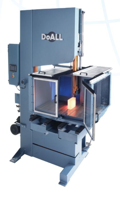
DoALL D-900 Diamond Saw – 35 x 16" Capacity