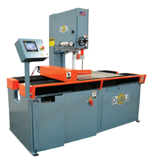
DoALL 2613-D36 – Diamond Saw – 26 x 13" Capacity for Dry Friable Materials

The efficient design of the DoALL diamond saws feature band speeds and feed rate control from the operator panel, resulting in reduced operating costs, minimal maintenance and lower total cost of ownership.