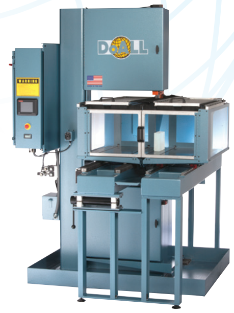
DoALL 2616-D24 Diamond Saw – 26 x 16" Capacity