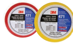
3M™ Vinyl Tape, 471, yellow/red, 2.0 in x 36.0 yd x 5.2 mil (5.1 cm x 32.9 m x 0.1 mm)