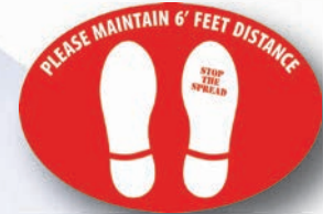
FLOOR DECAL Item #: DGI1812OVMTR SIZE: 18 x 12 PRICE: $8.49/EA