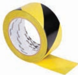
3M™ Hazard Warning Tape 766, black/yellow 3.0 in x 36.0 yd x 5.0 mil (7.6 cm x 32.9 m x 0.13 mm)