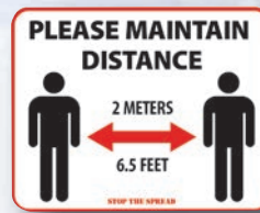
WALL DECAL Item #: DGI2016PMD SIZE: 20 x 16 PRICE: $12.95/EA