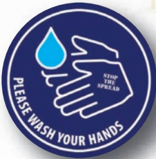
FLOOR DECAL Item #: DGI1212WHC SIZE: 12 X 12 PRICE: $5.95/EA

Working together to promote healthy physical distancing, we can stop the spread