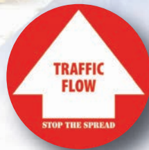
FLOOR DECAL Item #: DGI1212TFC SIZE: 12 X 12 PRICE: $5.95/EA