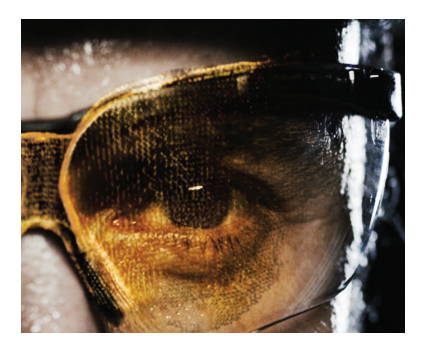
HydroShield anti-fog coating is permanently bonded to the lens, featuring dual-action properties that keep lenses clear up to 60X longer than our next best coating.