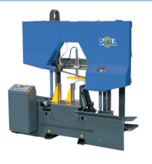
DoALL TDC-600SA Olympia Tube Saw – 24" Tube Capacity