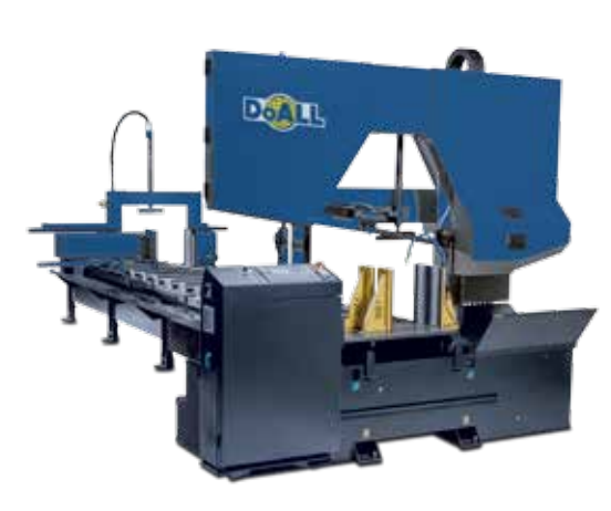
DoALL TDC-600CNC Olympia Tube Saw – 24" Tube Capacity