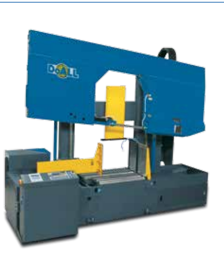
DoALL TDC-1000SA Olympia Tube Saw – 40" Tube Capacity