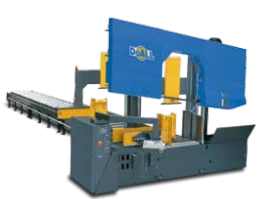
DoALL TDC-1000CNC Olympia Tube Saw – 40" Tube Capacity